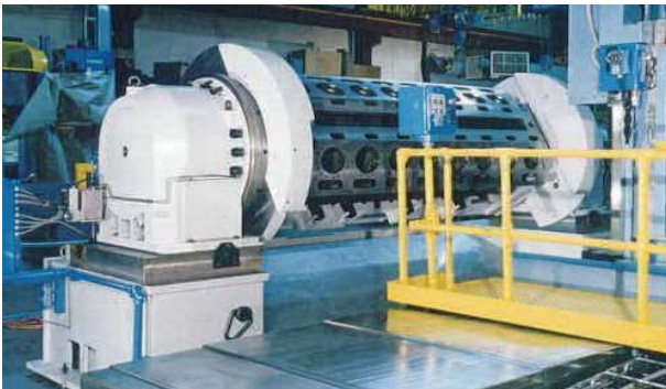
V16 Tilting Table