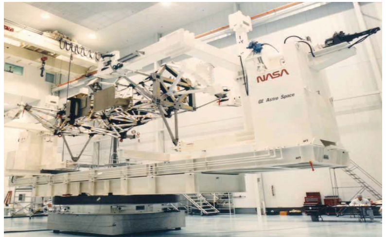
4000mm NASA Satellite Assembly Table