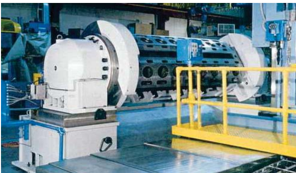
V16 Tilting Table