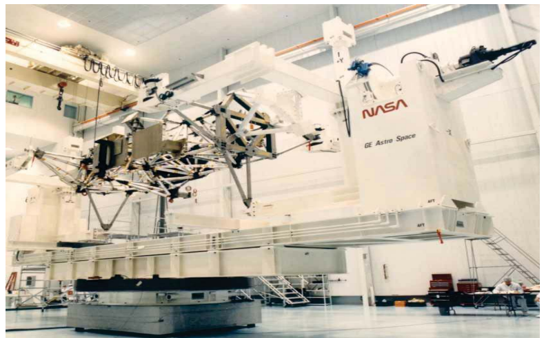
4000mm NASA Satellite Assembly Table